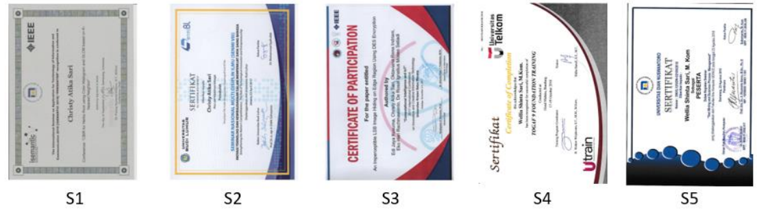
Figure 4. Sample of Host Images (512x512 pixels)

The image used in this study amounted to 18 images including 5 host images with each ending in JPEG, BMP and TIFF image files and 1 watermark image with each ending JPG, BMP and TIFF image files as show in Figure 4. Whereas, Figure 5 represent watermark in this proposed paper.