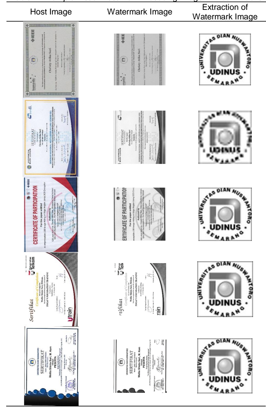
Table 2. A Result of MSE, PSNR, SSIM and NC