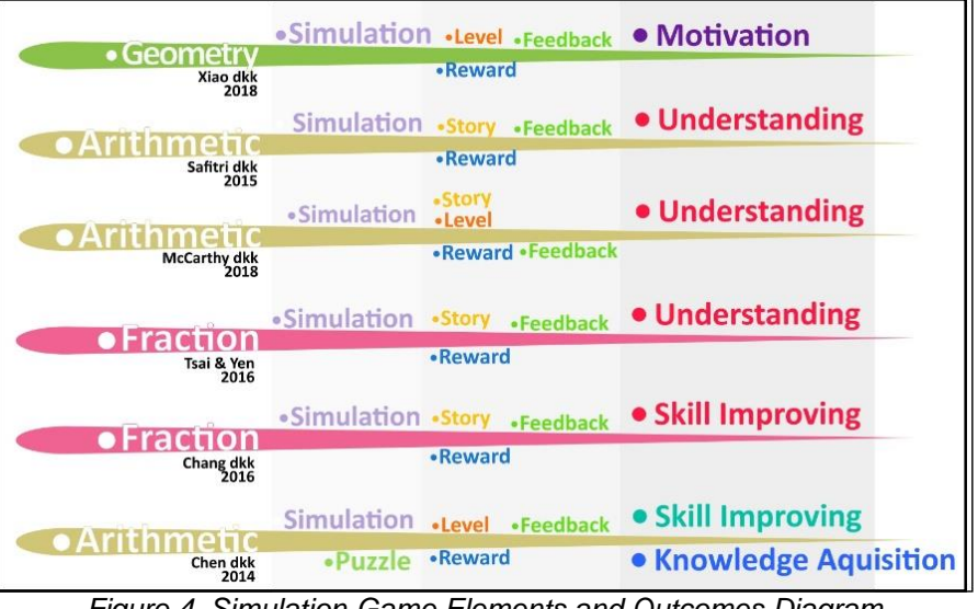
Figure 4. Simulation-Game Elements and Outcomes Diagram