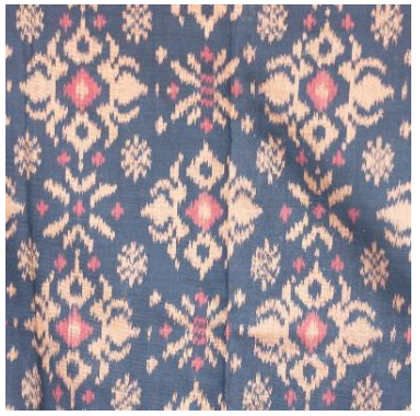
Figure 2. Endek

Figure 2 in this research, the data used is Endek images taken with RAW format. The advantage of using images with RAW format is the uncompressed image file, thus storing more information when compared to the compressed image file. Images were taken at three locations in Bali, namely CV. Artha Dharma located in Buleleng, Agung Bali Collection located in Bangli, and Pengrajin Sri Rejeki located in Klungkung.